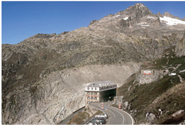
Where has the ice gone?