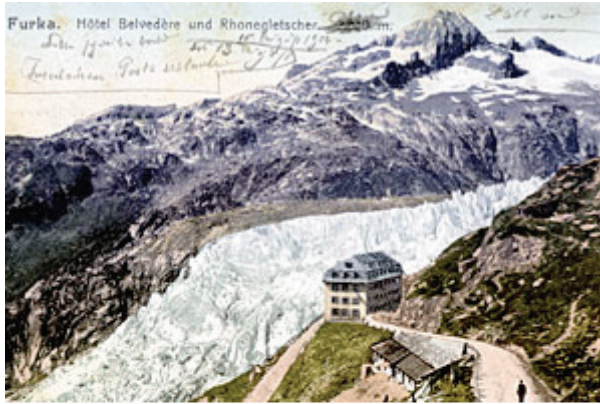
Glaciers in Europe 100 years ago.