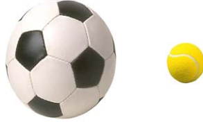
a soccer ball a tennis ball